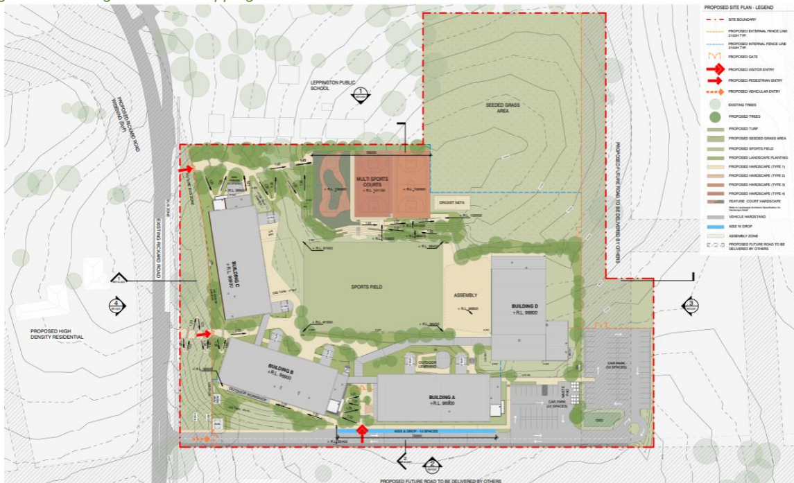
Figure 2: New Highschool for Leppington and Denham Court

The northern portion of the site is currently used for residential purposes. The southern portion of the site is used for agricultural purposes, with multiple greenhouses and an existing pond on the property.